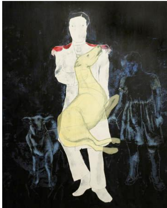
Falling Horse in Battle, 2008

Albion New York is pleased to present an exhibition of new drawings, paintings and animations by the Iranian-born artist Avish Khebrehzadeh . Opening on September 18, this will be the artist's first solo exhibition in New York City.